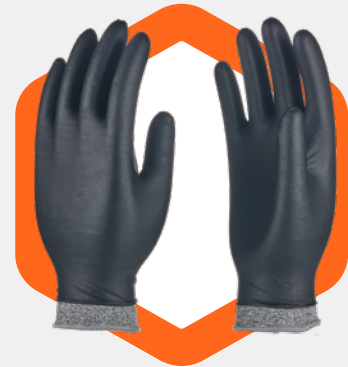
SUITABLE FOR USE UNDER DISPOSABLE GLOVES

Mastering this unique knitting process has enabled EISEN to produce the finest seamless knitted protective gloves available. Unparalleled dexterity. Maximum tactility.